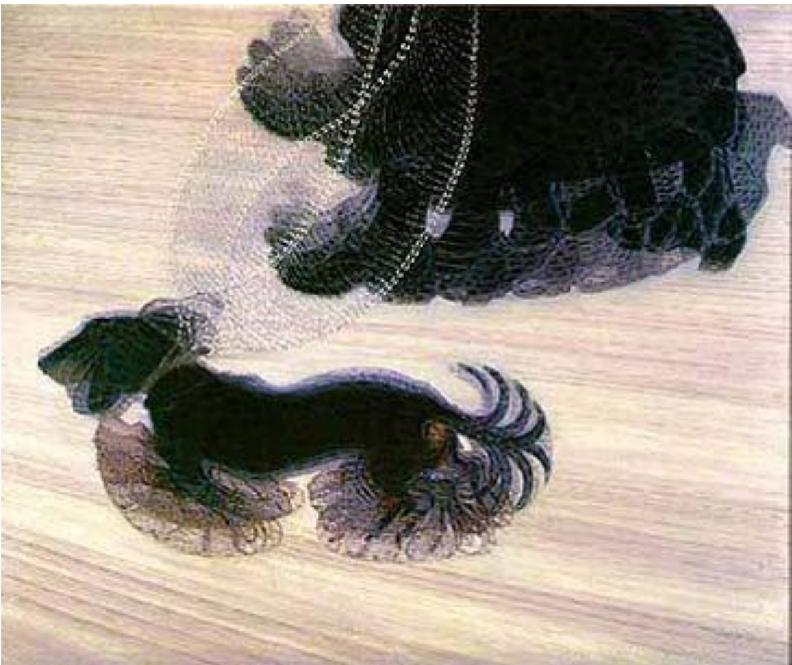
Giacomo Balla "Dynamism of a Dog on a Leash"

In 1982, Winogrand did something that altered his shooting style and another that may have ultimately changed it radically. He bought a motor drive for his Leicas, which allowed his already fast shooting technique to accelerate even more. John Szarkowski speculates that this unmediated, automatic, advance device fueled a decline in his late style, as it removed that critical connection between mind and hand. That very same day he bought an 8 x 10 view camera, the same format employed by the meticulous Edward Weston; but he apparently never used it. Perhaps he sensed he would soon reach the end of what he could do with the Leicas. Or perhaps the motor drive was the entry point into a wholly new style that he never lived long enough to explore; perhaps by taking up the bulky 8x10 view camera (if he had lived longer), Winogrand may have evolved into a nature and landscape photographer. He had spoken about moving back to New York City and