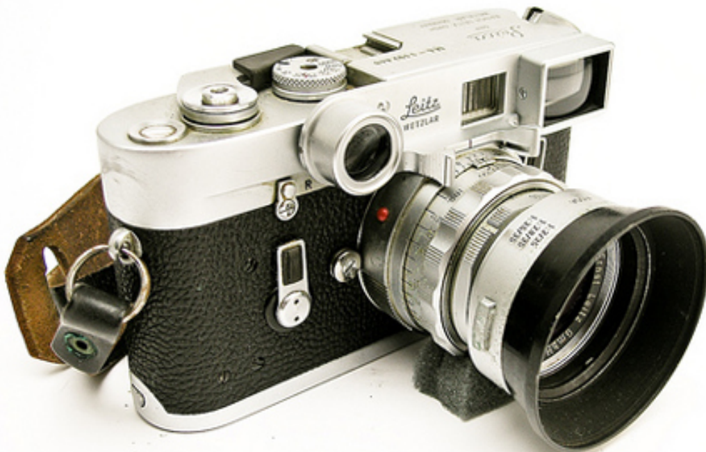
Leica M4, the camera used by Winogrand

He held his 35mm Leica M4 low in his right hand like a chain smoker bogarting his cigarette. When something caught his eye as he ambled down the sidewalk, the camera shot up to his face as if to take a toke. Even before the lens reached his eye, his finger snapped the shutter; then the wrist flicked the camera away as if shaking off a persistent ash, dropping it down again at his side. Hardly anyone ever knew they had become a Garry Winogrand photograph.