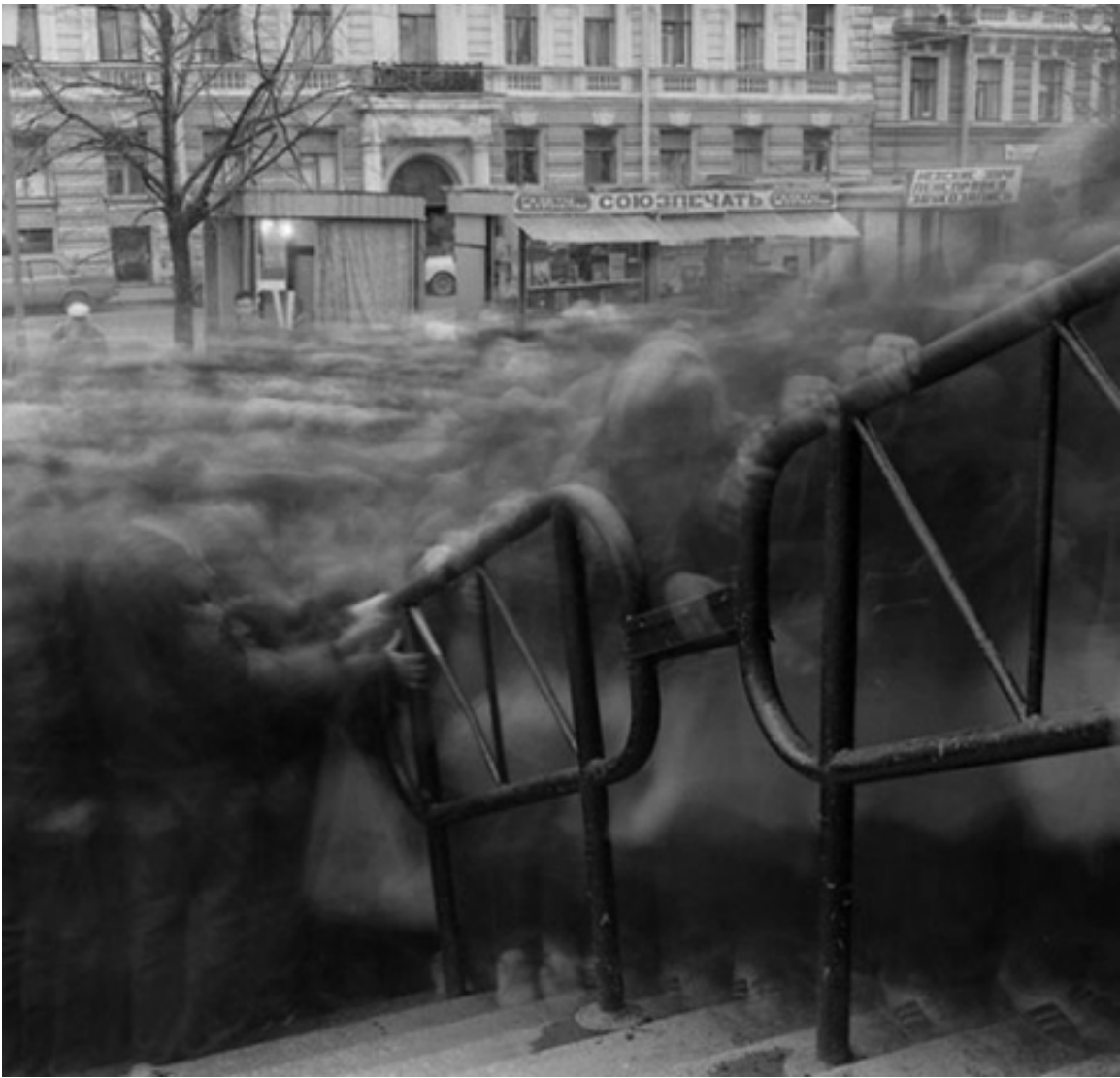
Titarenko "City of Shadows, Variant Crowd 2" 1993